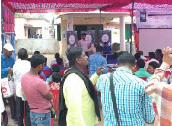
Figure 13: Financial literacy workshops at Karangamal

A financial literacy session at Kulingamal village is under process in with the local NGO head from Ayusham. An audio-visual session on BHIM and *99# in process.