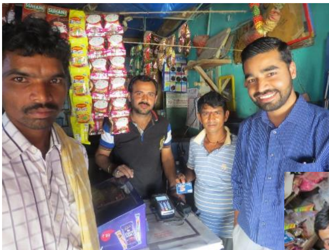
Figure 4: First PoS machine installed with support from SBI

One of the merchants is accepting payments using POS terminals in the inception stage of the project. Another merchant shared that while there will be low adoption of this payment methodology, if most customers have RuPay card, card-based payments will most likely increase.