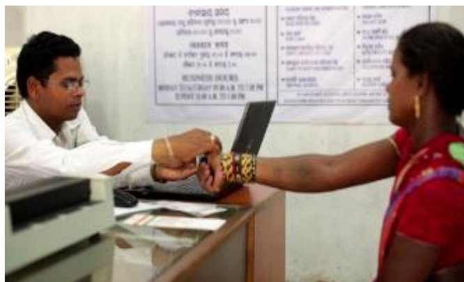
Figure 17: AEPS transaction being conducted by SBI BC for a daily-wage labourer at Karangamal