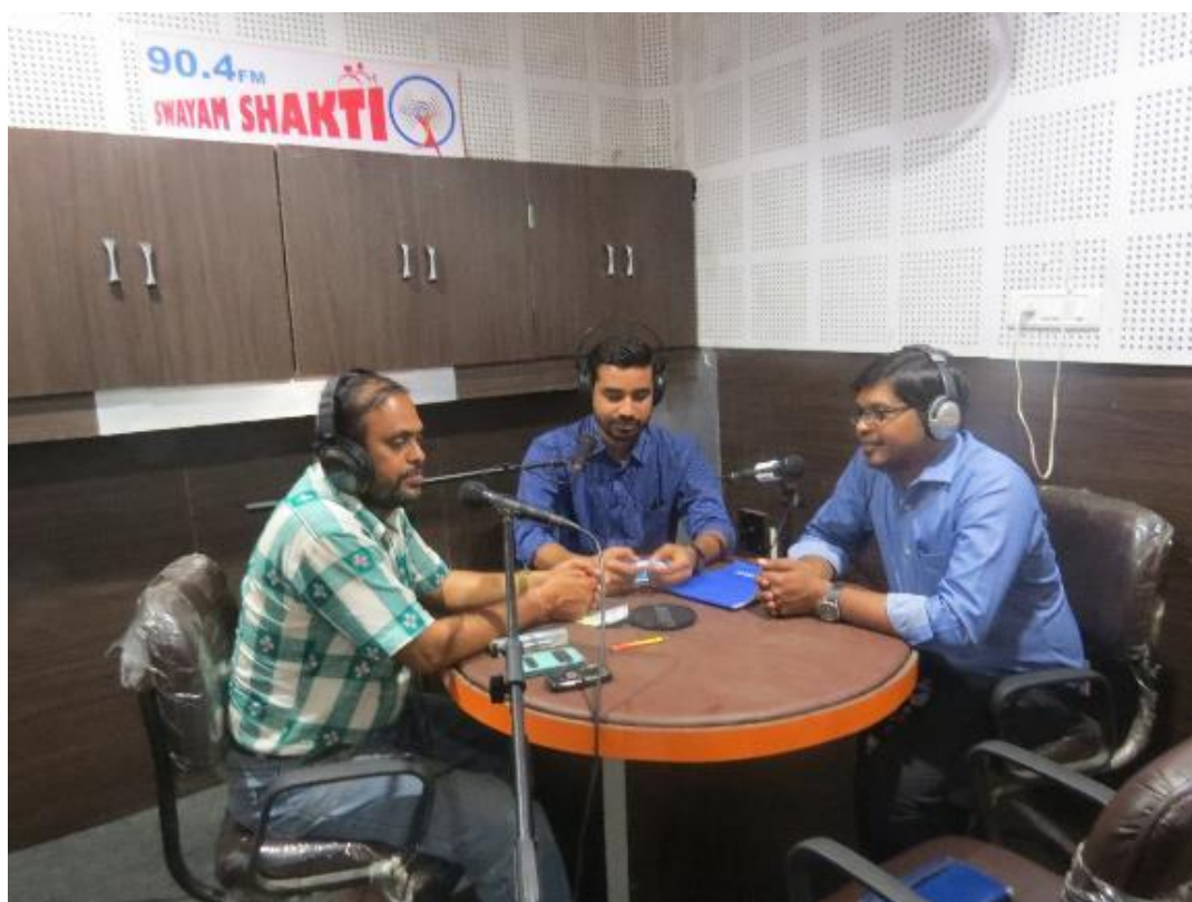
Figure 8: Radio promotion by MicroSave team at Swayam Shakti radio station at Khariar

This recording was broadcasted from 21 st to 23 rd February 2017. In the figure below, a snapshot of MicroSave team recording session at the studio in Khariar is shown. The SBI and UGB staff provided complete support to get the information regarding radio broadcast propagated to the residents of Karangamal panchayat.