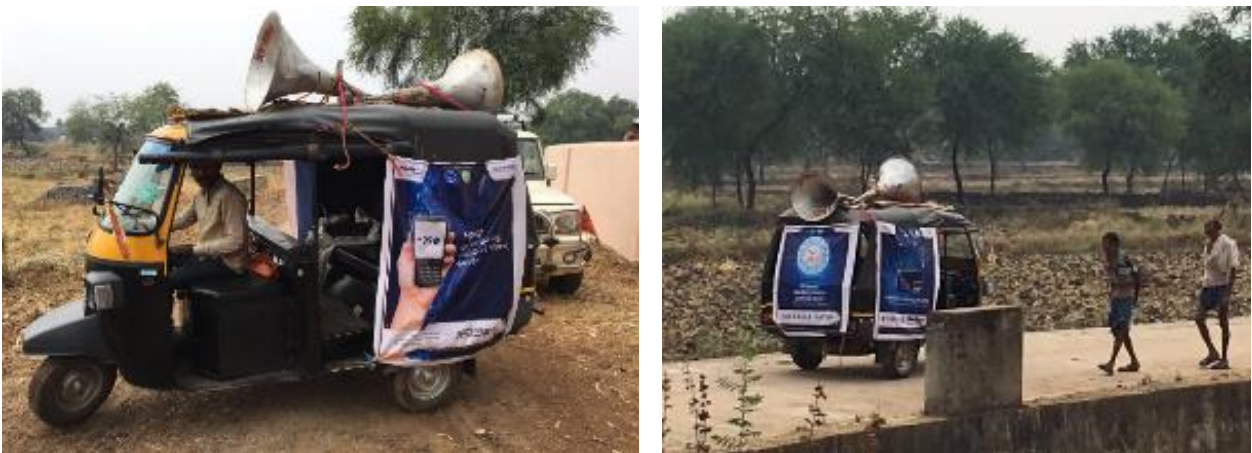
Figure 15: Mobile van promotion under-way during the campaigns

Similar to Phase-I, MicroSave sponsored van promotion in each of the five villages. Banners promoting *99#, BHIM, and RuPay card were put on Auto and a pre-recorded audio was played twice a day in each village. An announcement was also made to appraise villagers of dates and location of campaign. The extensive promotion of the workshop played a great role in generating interest amongst villagers for participating in the upcoming workshop.