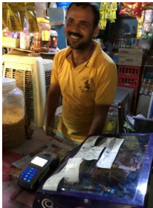
Figure 16: PoS machine usage and transaction history shown by the village merchant

The Business Correspondent of SBI provided complete support in the FL week. He conducted AEPS transactions for customers and explained the benefit of AEPS to customers. Almost all the villagers possess an Aadhaar card, and could relate easily to AEPS, as they have been using it regularly.