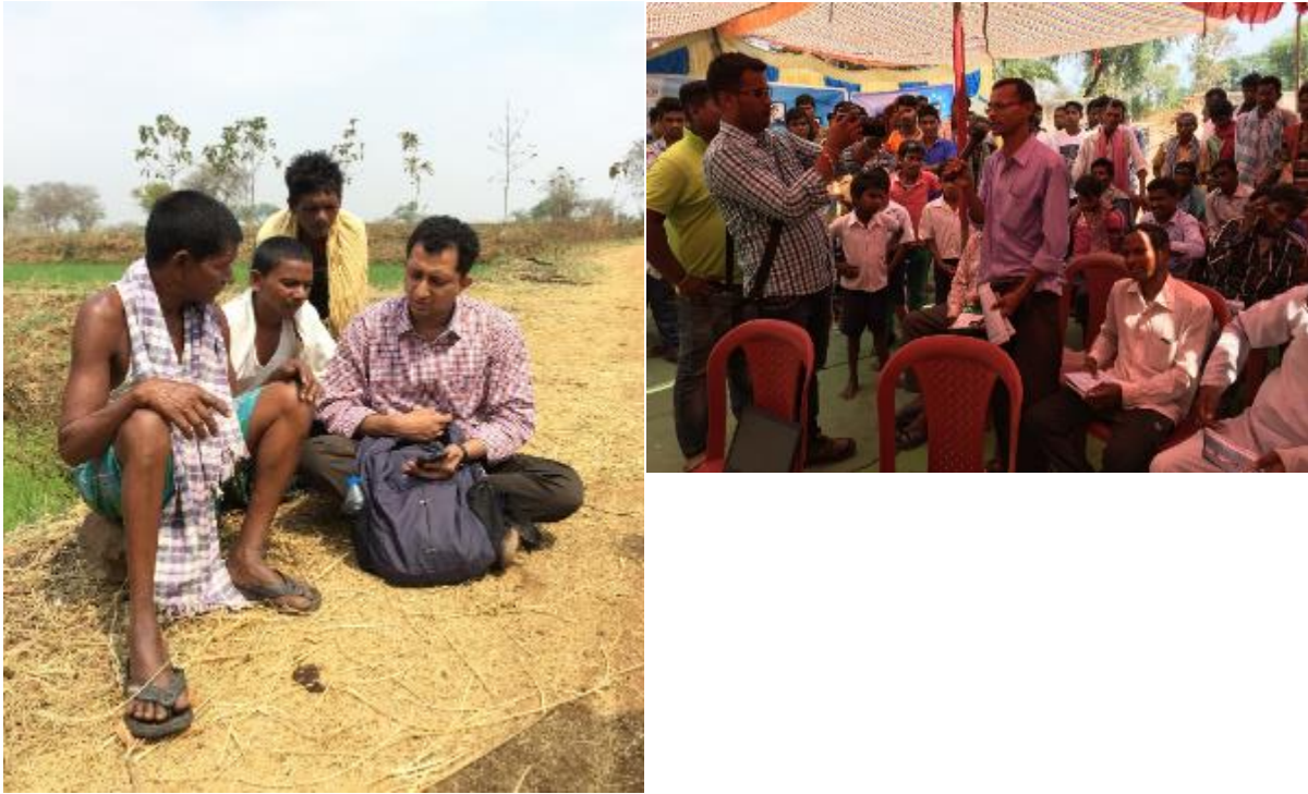
Figure 14: On-the-field training by MicroSave staff on *99#

MicroSave team also ensured that people working as farmers receive sufficient training on the field on different payment products. MicroSave also hired a cinematographer to capture the entire journey of Karangamal panchayat to “less-cash” panchayat.