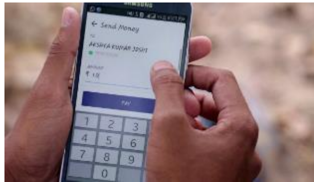
Figure 18: A BHIM transaction by a college student

The smartphone penetration in each of the villages is low. Villagers who had a smartphone downloaded the BHIM app. Villagers, especially youth, were excited to know about features of BHIM app. Connectivity issues in villages did not deter them from downloading the app and conducting transactions.