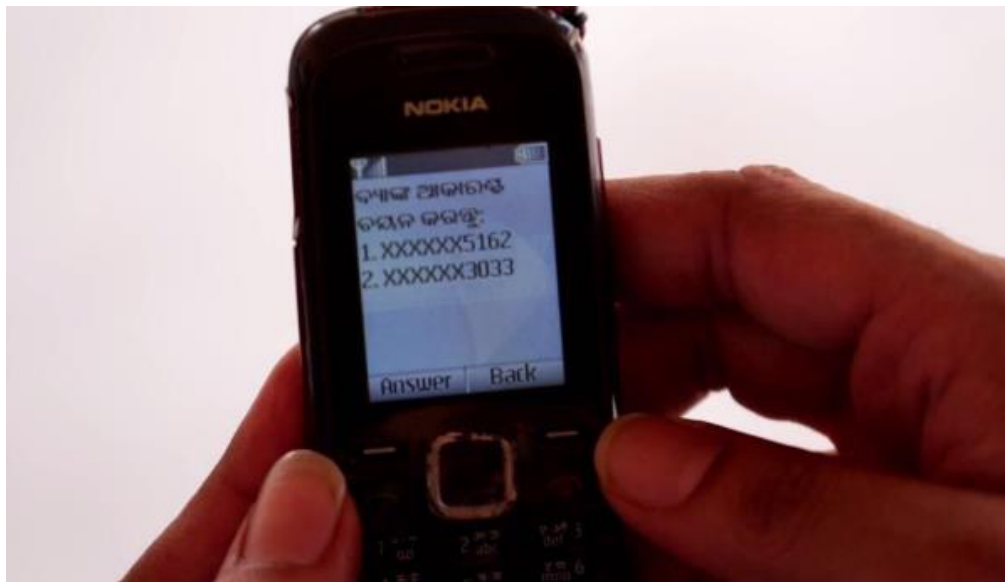
Figure 19: College principal using USSD

*99# was the maximum demonstrated product considering a huge feature and basic phone penetration. This product was easily understood and found to be of maximum utilisation. Village populace understood the importance of registration of mobile number when *99# was explained. With limited literacy, village populace could register themselves and conduct small amount test transactions.