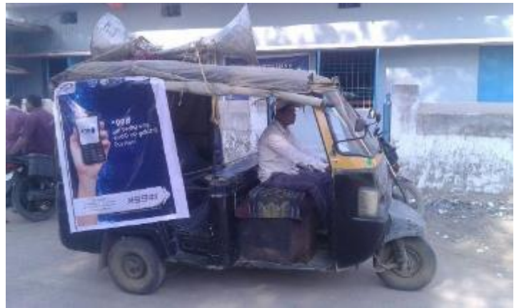
Figure 9: Mobile van activity before the workshop

The local bank branches of State Bank of India and Utkal Grameen Bank have also shown active interest in the promotion of *99#, BHIM, AEPS, IMPS and RuPay cards. MicroSave provided them with collateral that would help in increasing awareness on the products.