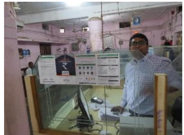
Figure 10: Collaterals by NPCI at State Bank of India, Boden branch on display