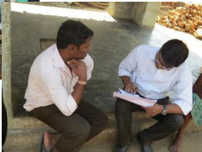
Figure 6: In discussion with a villager to understand their daily expenses

MicroSave team interacted with other key stakeholders such as Business Development Officer of Boden Block; principals and teachers of local schools in Karangamal,