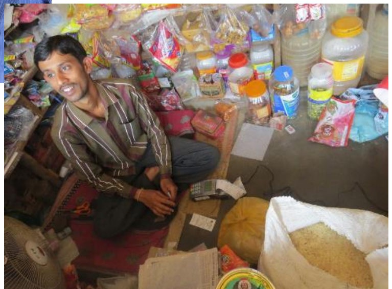
Figure 3: PoS installed at one more merchant during the base-line assessment