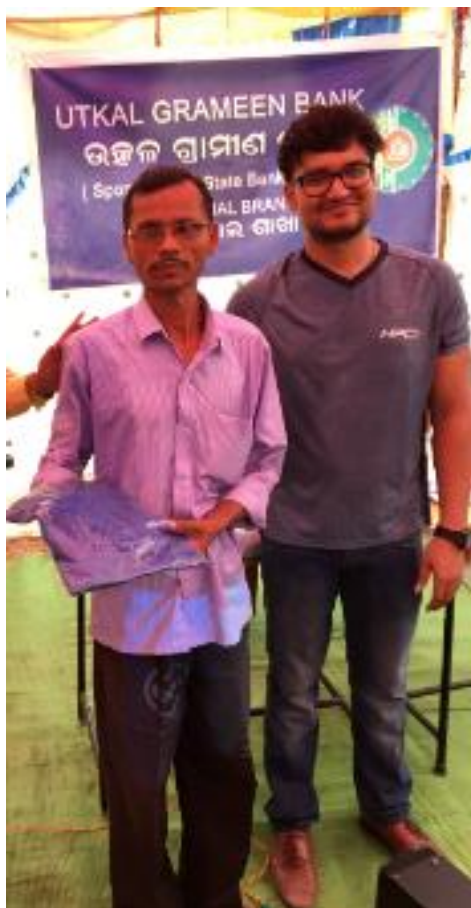
Figure 11: One of the winners of the Quiz contest

SBI and UGB bank managers provided extensive support through nodal officers for all the days of the workshop. These nodal officers acted as interim trainers to help village resident register on *99# and BHIM besides providing them training on the processes. The villagers were trained on transferring money to bank accounts, mobile numbers, and Aadhaar numbers. Many people also got their Aadhaar and mobile number linked to their bank account and understood the importance of getting seeded.