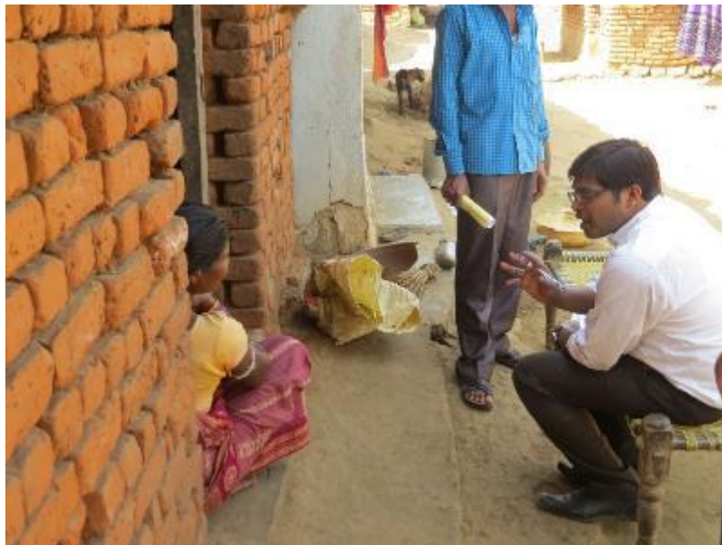
Figure 5: Baseline assessment of a villager on digital financial services

The village residents interviewed as part of the baseline belonged to different occupations. There were teachers, farmers, daily-wage labourers, besides government employees and private service holders. MicroSave also captured information on financial inflow and outflow at the household level. This included information such as major sources of inflow and outflow, ticket size, medium and frequency of each transaction. It helped MicroSave and NPCI to understand the readiness of the villagers to make digital payments.