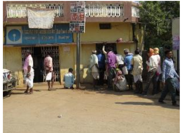
Figure 2: Support provided by the banks- with Bank Manager, UGB, Karangamal; long queues outside Boden SBI

The Panchayat has a total of 16 shops catering to different needs of the local residents. There are six shops in Karangamal village and ten small shops in four other villages. Out of these shops, six shops have been digitally enabled with point-of-sale terminals with the support of SBI. These merchants have shared interest in accepting payments using RuPay debit cards.