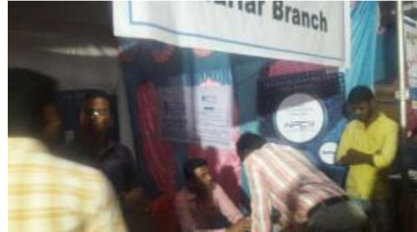
Figure 20: Promotion of NPCI products and services at Khariar Mahotsava, a yearly event at held Khariar