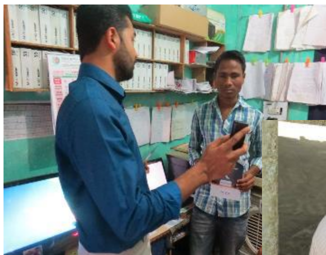
Figure 7: Training to UGB BC agent on USSD

MicroSave team also interacted with the existing Business Correspondents in the panchayat. There are two BCs – SBI and UGB in the panchayat. Their inputs were also taken on digitisation of payments in their panchayat. BCs added that *99#, AEPS, and BHIM will definitely help, provided sufficient training is provided to the villagers. They were willing to assist in promoting the agenda of less-cash panchayat.