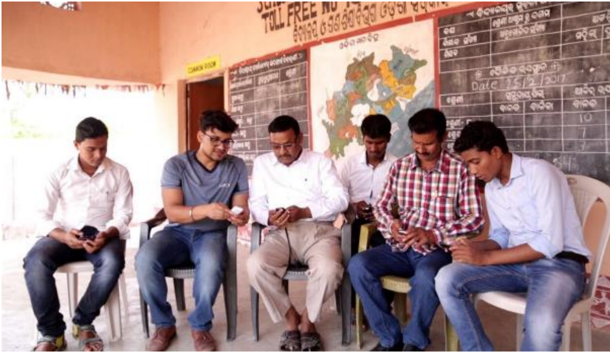
Figure 12: Training to the school principal and staffs on *99#, BHIM app, RuPay and AEPS

In the first workshop at Karangamal village, people are attentively listening to the MicroSave and NPCI team.